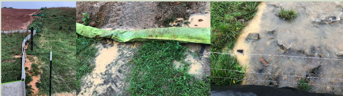
From left to right: Failed erosion and sediment control along the MVP route in Giles County, Va., during MVP construction in October 2018. Sediment escapes the construction site through failed sediment control measures. A stream is impacted by sediment deposition and increased streambank erosion.

The West Virginia Department of Environmental Protection (DEP) and the Virginia Department of Environmental Quality (DEQ) employ or contract inspectors to monitor MVP's construction, who then file ongoing reports of their observations. If the agency determines there were likely violations of law, regulation, or permit conditions, the agency sends the company a letter called a Notice of Violation. The state environmental agency may then work with the company to resolve the violations, but if violations are egregious in number or scope, or the company does not appear to be fixing the violations, the agency may file a legal complaint.