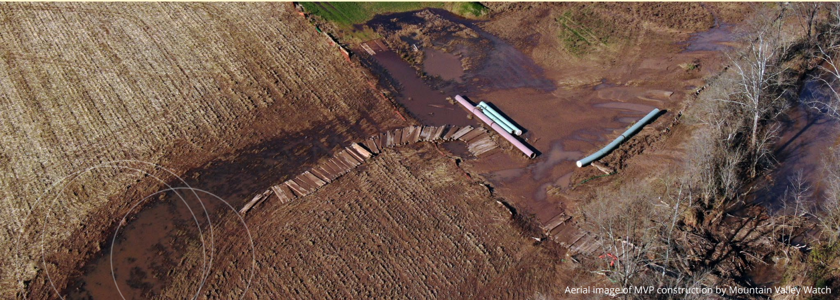
Aerial image of MVP construction