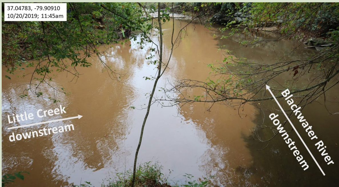
Heavy sediment from Little Creek flows into the Blackwater River in October 2019. Little Creek is crossed several times by the Mountain Valley Pipeline in Franklin County, Va.

In Roanoke County, experts raised significant concerns about the proposed crossing on the Roanoke River approximately 1.1 miles upstream from a drinking water intake for the Western Virginia Water Authority. 78,79 The authority provides drinking water to approximately 69,000 customers in the city of Roanoke and Roanoke, Franklin and Botetourt counties. 80 Additional sedimentation and turbidity in waterbodies complicates drinking water treatment. In its 2018 lawsuit, the Virginia attorney general noted that the Department of Environmental Quality observed approximately 350 square feet of wetland containing sediment in Roanoke County where the MVP did not possess a permit to discharge into the waters. 81